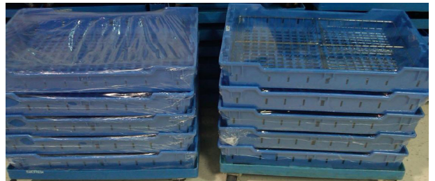
Polyethylene Shrink Film